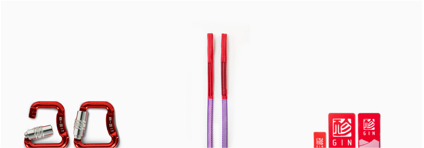
40 mm Carabiner